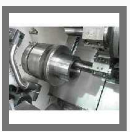
CNC Precision Work