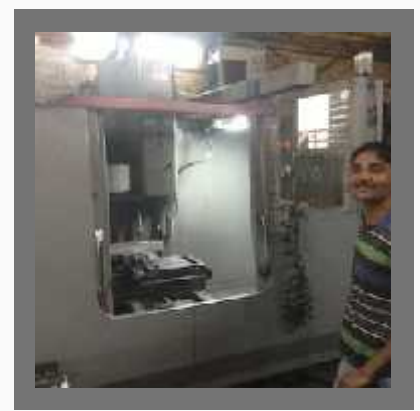
VMC Job Work