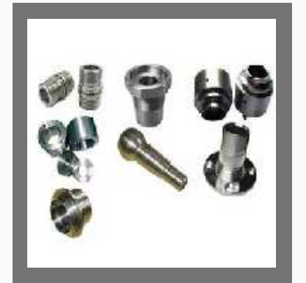
CNC Turning Job Work