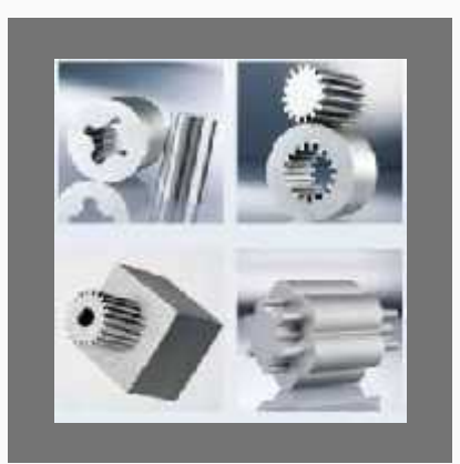
CNC Wire Cut Machine Job Work