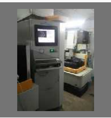
CNC Wire Cut Machine Job Work