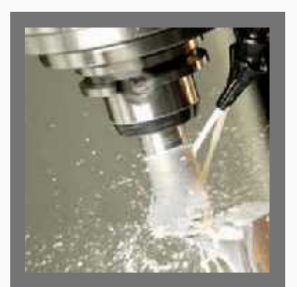
CNC Turning Job Work