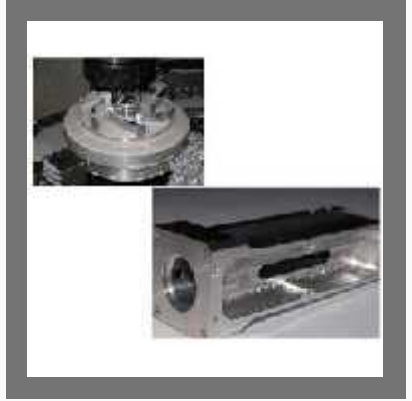
VMC Milling Machine Job Work