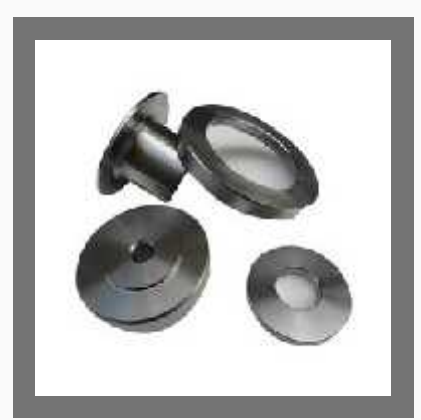
CNC Metal Parts